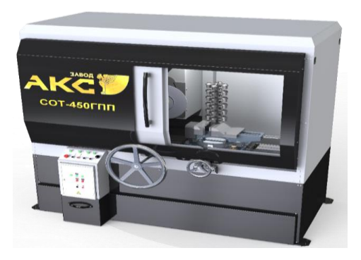
Installation for removing ceramics from the internal cavities of the blades.

Installation for blowing the surface of a casting from ceramics and carbon deposits